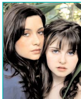
Juice Magazine/ Utopia Newsletter April 2007